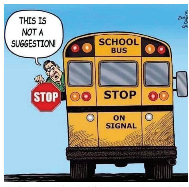
School is starting again! Please be mindful of the buses carrying our students!!

Adult meal prices have not be determined yet.